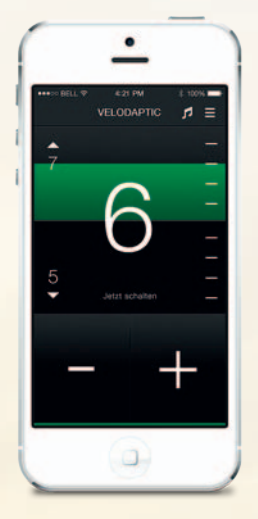
Always in the right gear: The VELODAPTIC app

stays in the right gear, without having to shift manually. The app accompanies you on the road and records your GPS, movement, and performance data.