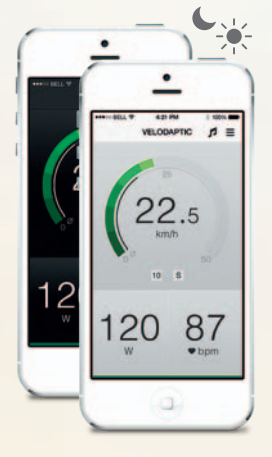
The rider can choose between daytime and nighttime mode, depending on the light conditions