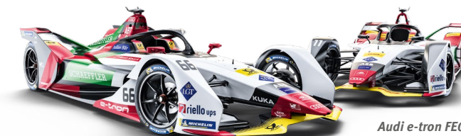
Audi e-tron FE05

Point system 1 25 pts. 2 18 pts. 3 15 pts. 4 12 pts. 5 10 pts. 6 8 pts. 7 6 pts. 8 4 pts. 9 2 pts. 10 1 pt.