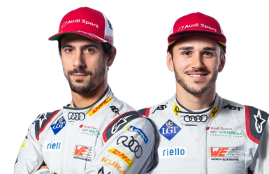
Lucas di Grassi